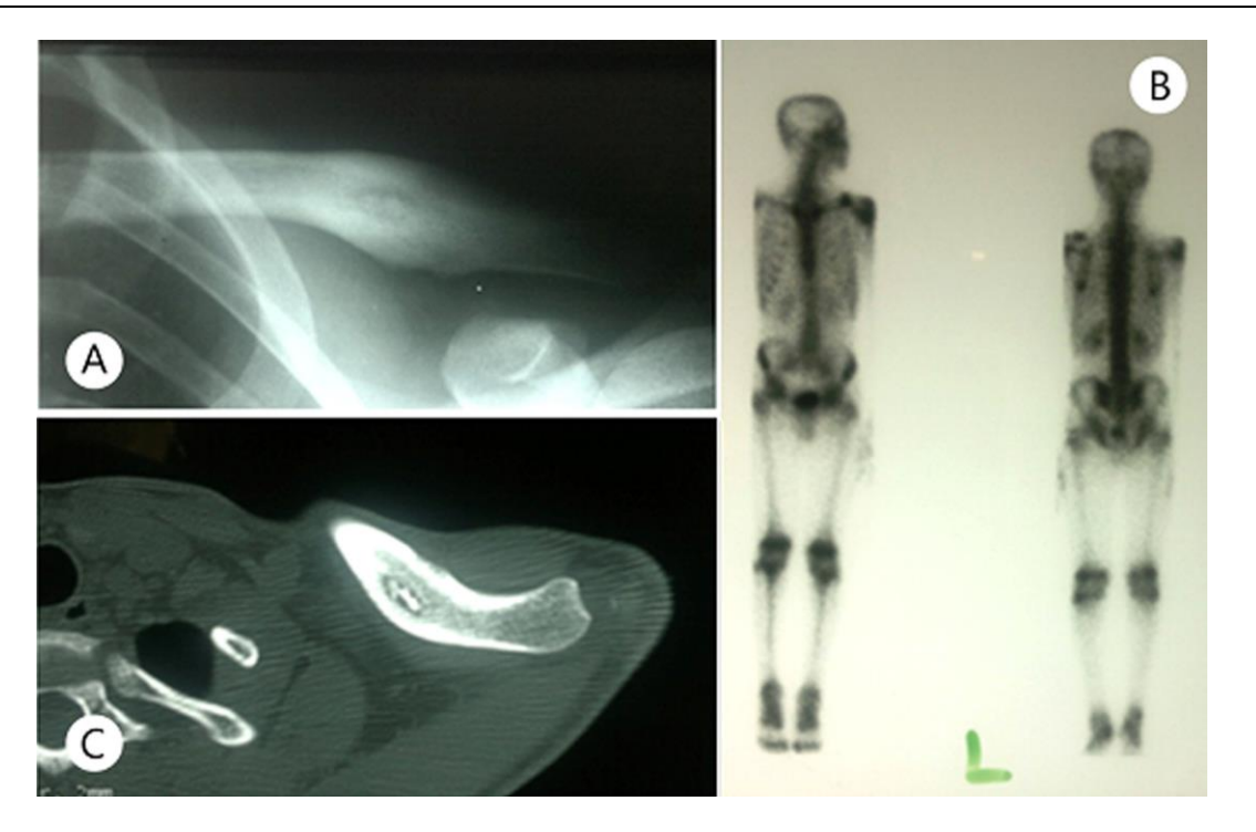
Fig 2. Osteoid osteoma of the clavicle. A. Radiography of left clavicle of a 17 year-old boy with shoulder pain in the previous 12 months. Image B shows lucency with nidus and bone reaction. Bone scan shows increased uptake at mid clavicle. C. The CT scan is helpful in detection and localizing the nidus.

teoma and clavicle lesion radiofrequency ablation was performed. For other six patients excisional biopsy (4 patients) and curettage bone graft (2 patients) were performed. All 8 patients after 33 months follow up had a good outcome in terms of pain relief.