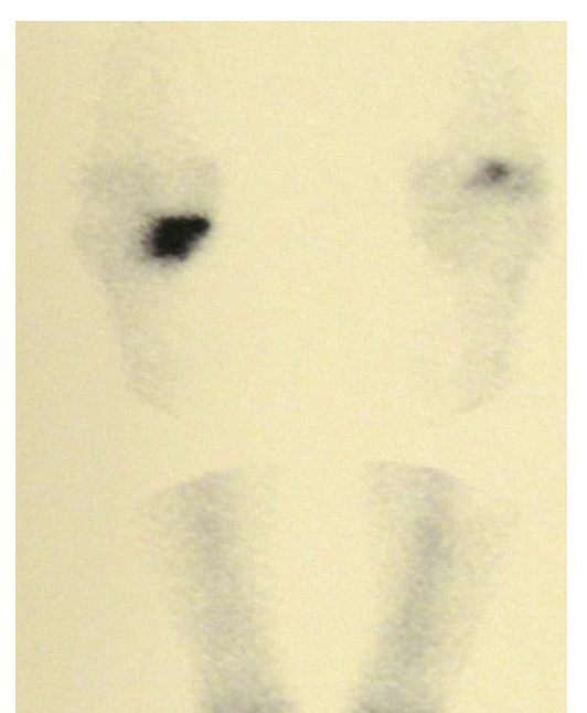
Fig 5. Tc-99m bone scans revealed increase uptake in medial condyle of tibia (case G).