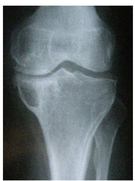
Fig. 2. Antero-posterior radiograph of the proximal tibia showed a well-defined lytic lesion in the medial condyle of the tibia with degenerative joint disease (Case B).

We performed MRI in all patients. Accordingly, there was isointense lesion on T1-weighted images with respect to muscle. These lesions were hyperintense homogeneous mass on T2-weighted sequences. In all of our cases, there was connection between IG and soft tissue component of the cyst