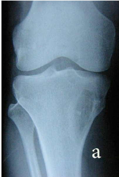
Fig 1. Antero-posterior radiograph of the proximal tibia showed a well-defined lytic lesion in the medial condyle of the tibia without surrounding sclerosis (case F).