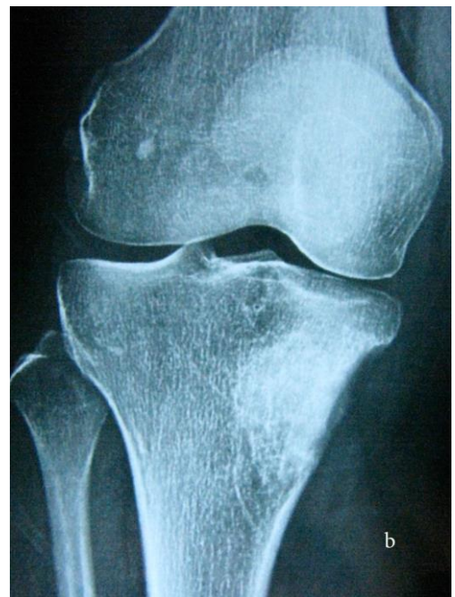
Fig 7. A 2 years post-operative, anteroposterior radiograph of the proximal tibia revealed a well incorporation of the allograft and solid union (case F).

In Tc-99 bones scan, which was performed in two our patients we just found slight activity increase in the tibial plateau (Fig. 5).