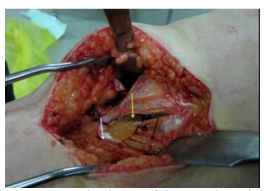
Fig 6. Intraoperative image of the case showed the relationships of the intraosseous ganglion (yellow arrow) to the pes anserine bursa (black arrow) and pes anserine tendon (white arrow) (case D).

In Tc-99 bones scan, which was performed in two our patients we just found slight activity increase in the tibial plateau (Fig. 5).