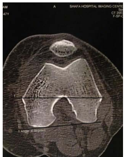
Fig. 2. The anatomical transepicondylar axis is in 4 degrees externally rotation related to the posterior condylar axis in the same case (Curtsey to Archive unit of Shafa Orthopedic Hospital)

femoral distal metaphysis perpendicular to mechanical axes of the femur. All of the scans were analyzed by two knee surgeons separately. The rotation of distal femur was evaluated using the single axial CT image through the femoral epicondyles. This cut is 28 -32 mm above joint line that the medial sulcus is usually seen in it. Sometimes in the medial sulcus there is some small holes related to nutrient vessels. Four lines were drawn digitally in this view on the monitor: 1) The anatomical transepicondylar axis (A-TEA), connects the lateral and medial epi-