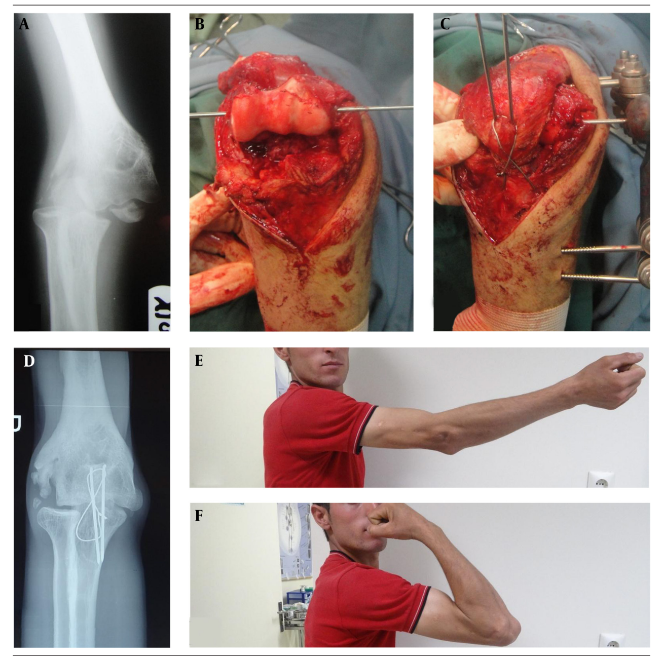
Figure 1. A, Preoperative X-Ray; B, Articular Surface Exposure with Olecranon Osteotomy; C, Tension Band Fixation and Hinge External Fixator Application; D, Final X-Ray after External Fixator Removal; E, F, Postoperative Range of Motion

collateral ligaments. All fibrous tissue was removed from the joint space. If there was any displaced fracture interfering with stability, it was reduced or reconstructed and fixed; otherwise, it was removed. Thereafter, the ulnohumeral joint was reduced and ROM was evaluated. In the olecranon osteotomy technique, the olecranon was first fixed temporarily with a towel clip and then ROM was evaluated. In the long standing cases, usually there was a limitation of flexion. In these cases, with a fractional lengthening through the musculotendinous junction of the distal triceps (Figure 2) and manipulation, the desired