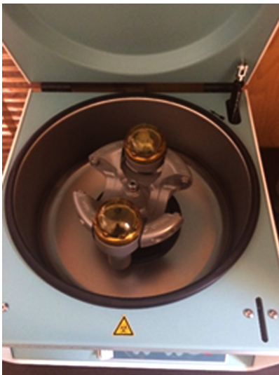
Figure 2. Centrifuger and Plasma Separation From RBCs and Ready for Intra-Articular Injection