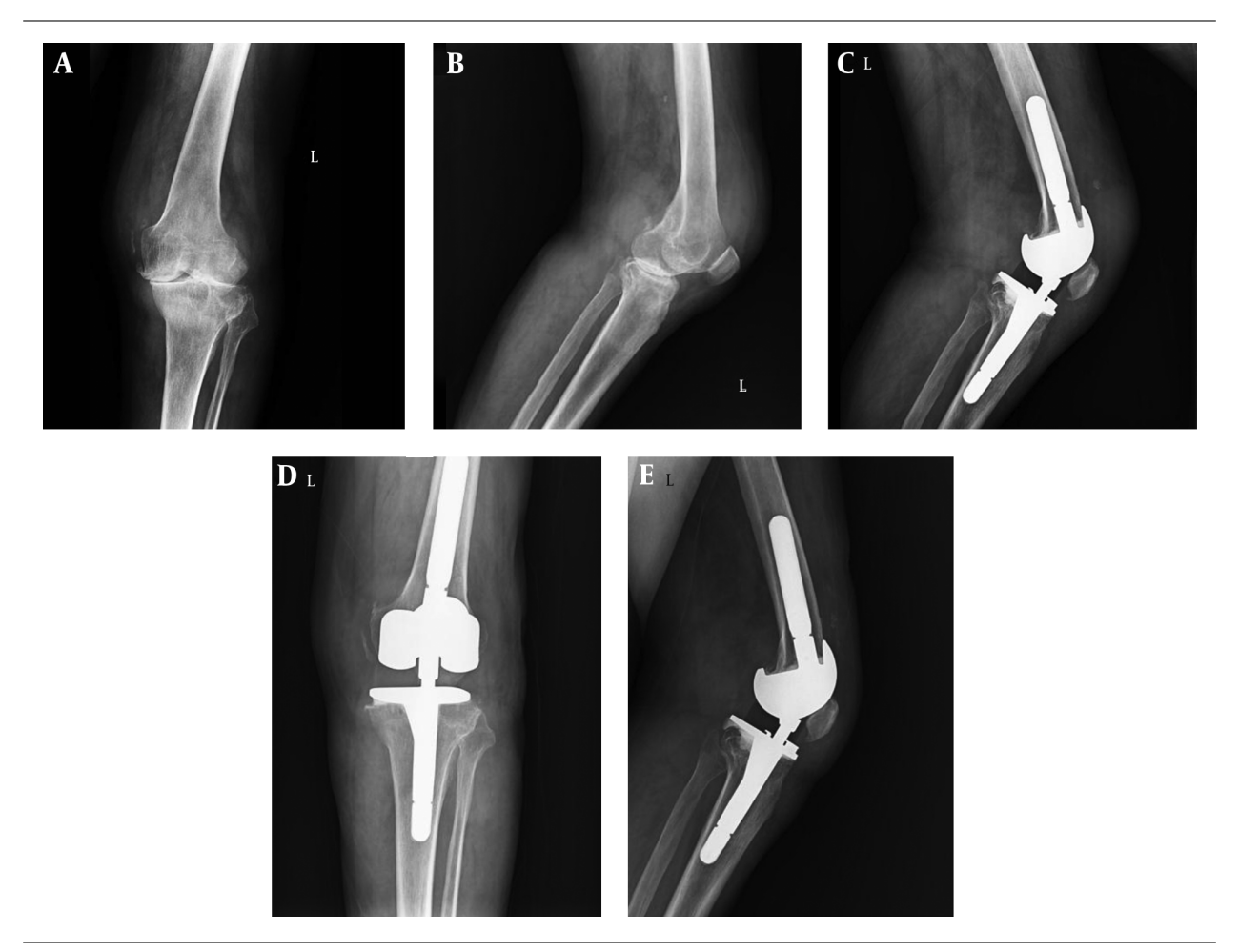
Figure 3. A and B, radiographs show grade 3 osteoarthritis; C, 10 weeks postoperative radiograph after quadriceps tendon rupture; D and E, 9 months after total knee arthroplasty

Figure 2. A, MRI shows diffuse PVNS; B, radiography shows grade 3 osteoarthritis; C, final follow up radiography with well-fixed prosthesis