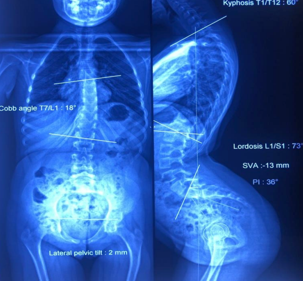
Figure 3. Plain radiographic 1 year after the treatment

ter thyter the edly reported in the literature. Vialle et al. [1] reported lumbar hyperlordosis of neuromuscular origin in 27 pa-