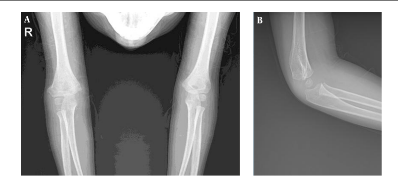
Figure 3. (A) anteroposterior and (B) lateral radiographs after 8 months

Table 2. Demographic Data, Radiographic and Functional Outcomes of Patients with Lately Presented Lateral Humeral Condyle Fracture Underwent Open Reduction and Internal Fixation of the Fracture