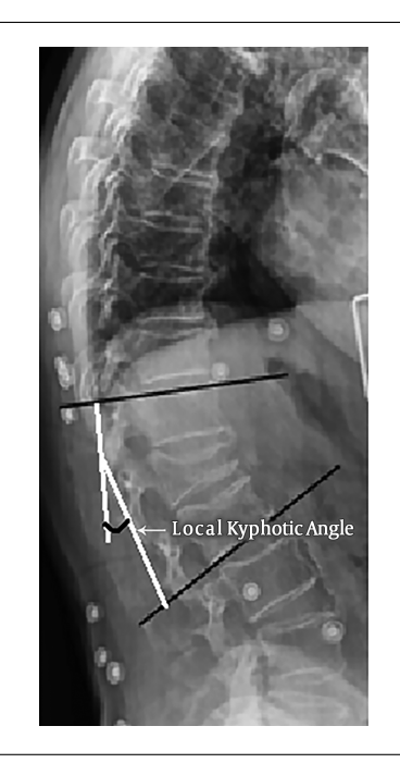
Figure 1. Measurement of local kyphosis, using the Cobb method between superior and inferior vertebrae of the affected vertebra

radiograph, bone mineral density (BMD), magnetic resonance imaging (MRI), computed tomography (CT) scanning, and test of blood 25 (OH) vitamin D level were performed on all patients in the beginning of the study as well. Baseline local kyphosis angle (LKA) was measured using the Cobb method between superior and inferior vertebra of affected level on standing lateral radiograph of affected vertebra (Figure 1). OVCF was classified as: superior endplate, inferior endplate, and anterior cortical wall fracture (Figure 2).