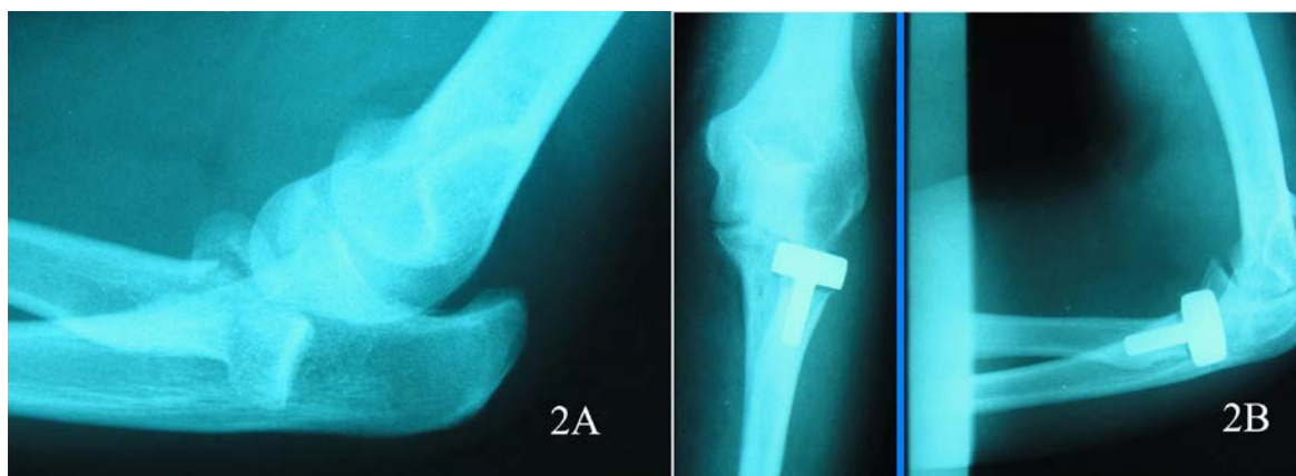
2. A. The comminuted fracture of radial head in terrible triad. B. the radial head arthroplasty.

The mean flexion-extension arc of the elbow was 102.63^\circ \pm 33.22^\circ ( 5^\circ to 140^\circ ). The mean arc of pronation and supination were 60.53^\circ \pm 14.32^\circ ( 40^\circ - 80^\circ ) and 60^\circ \pm 13.72^\circ ( 30^\circ - 80^\circ ), respectively.