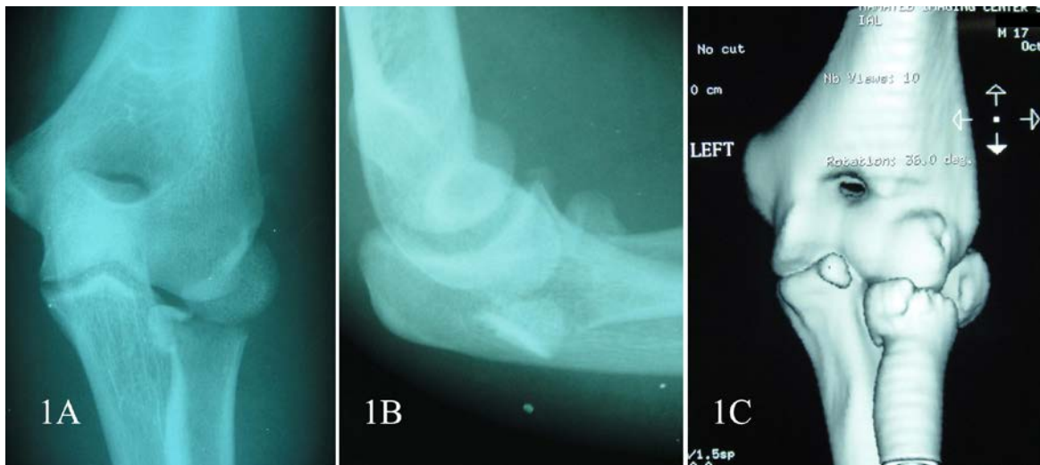
1. A &B. Anteroposterior and lateral radiography of radial head fracture in terrible triad. C. The same elbow CT scan.

In nine cases radial heads were fixed by mini-fragment 2 and 2.7mm T plates (Fig. 1. A, B, C, D, &E). The screw was applied to fix 4 radial head fractures as the only fixation device. Two small type I fractures were conservatively managed. They were neither resected nor reconstructed. One fracture was managed by arthroplasty (Fig. 2. A&B). The left three radial heads could not be restored and were resected. We could not perform arthroplasty in these cases due to unavailability of prosthesis at the operation time.