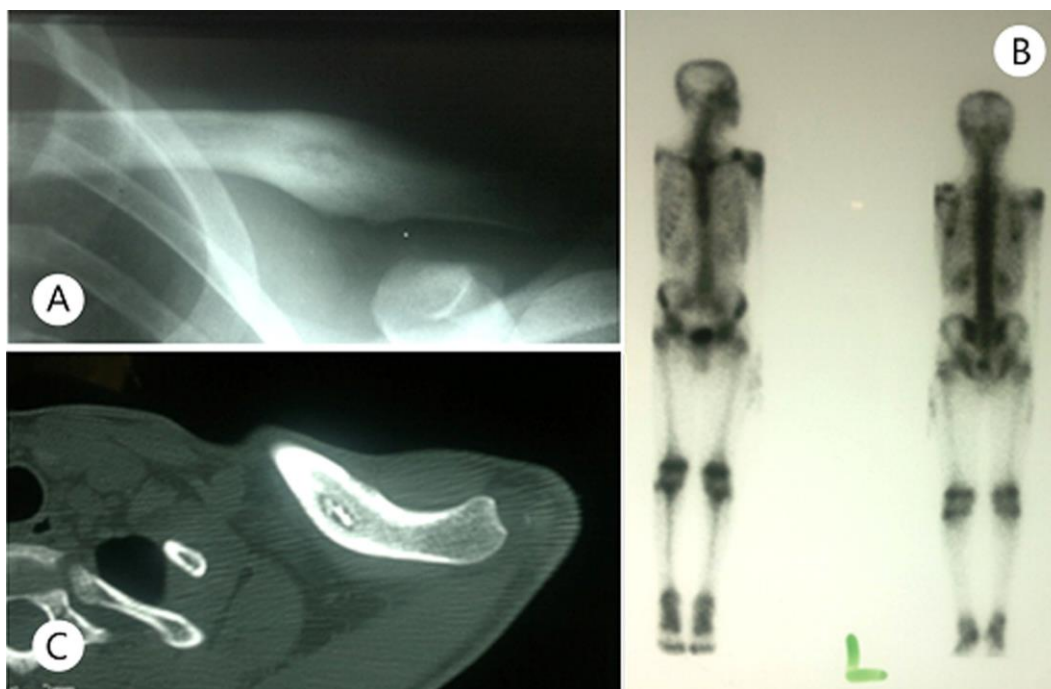
Fig 2. Osteoid osteoma of the clavicle. A. Radiography of left clavicle of a 17 year-old boy with shoulder pain in the previous 12 months. Image B shows lucency with nidus and bone reaction. Bone scan shows increased uptake at mid clavicle. C. The CT scan is helpful in detection and localizing the nidus.

teoma and clavicle lesion radiofrequency ablation was performed. For other six patients excisional biopsy (4 patients) and curettage bone graft (2 patients) were performed. All 8 patients after 33 months follow up had a good outcome in terms of pain relief.