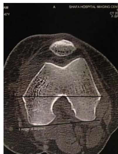
Fig. 2. The anatomical transepicondylar axis is in 4 degrees externally rotation related to the posterior condylar axis in the same case

femoral distal metaphysis perpendicular to mechanical axes of the femur. All of the scans were analyzed by two knee surgeons separately. The rotation of distal femur was evaluated using the single axial CT image through the femoral epicondyles. This cut is 28 -32 mm above joint line that the medial sulcus is usually seen in it. Sometimes in the medial sulcus there is some small holes related to nutrient vessels. Four lines were drawn digitally in this view on the monitor: 1) The anatomical transepicondylar axis (A-TEA), connects the lateral and medial epi-