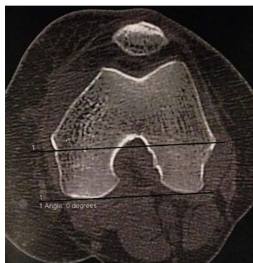
Fig. 1. The surgical transepicondylar axis is parallel to the posterior condylar axis in a 46 years old lady

On the other hand, evaluation and determination of bony landmarks of the distal femur during surgery in patients with severe knee osteoarthritis is difficult especially if the surgeon lacks adequate skill and can't dissect the soft tissue around the epicondyles without collateral ligaments injury. That is why, preoperative CT scanning approaches have been advised by some researchers (2, 10, 11). By preoperative CT scan, the surgeon can precisely evaluate the angles among transepicondylar axis and anteroposterior line with posterior condylar axis and the possibility of the malposition of the femur may decrease during surgery. Sometimes determination of the medial sulcus in