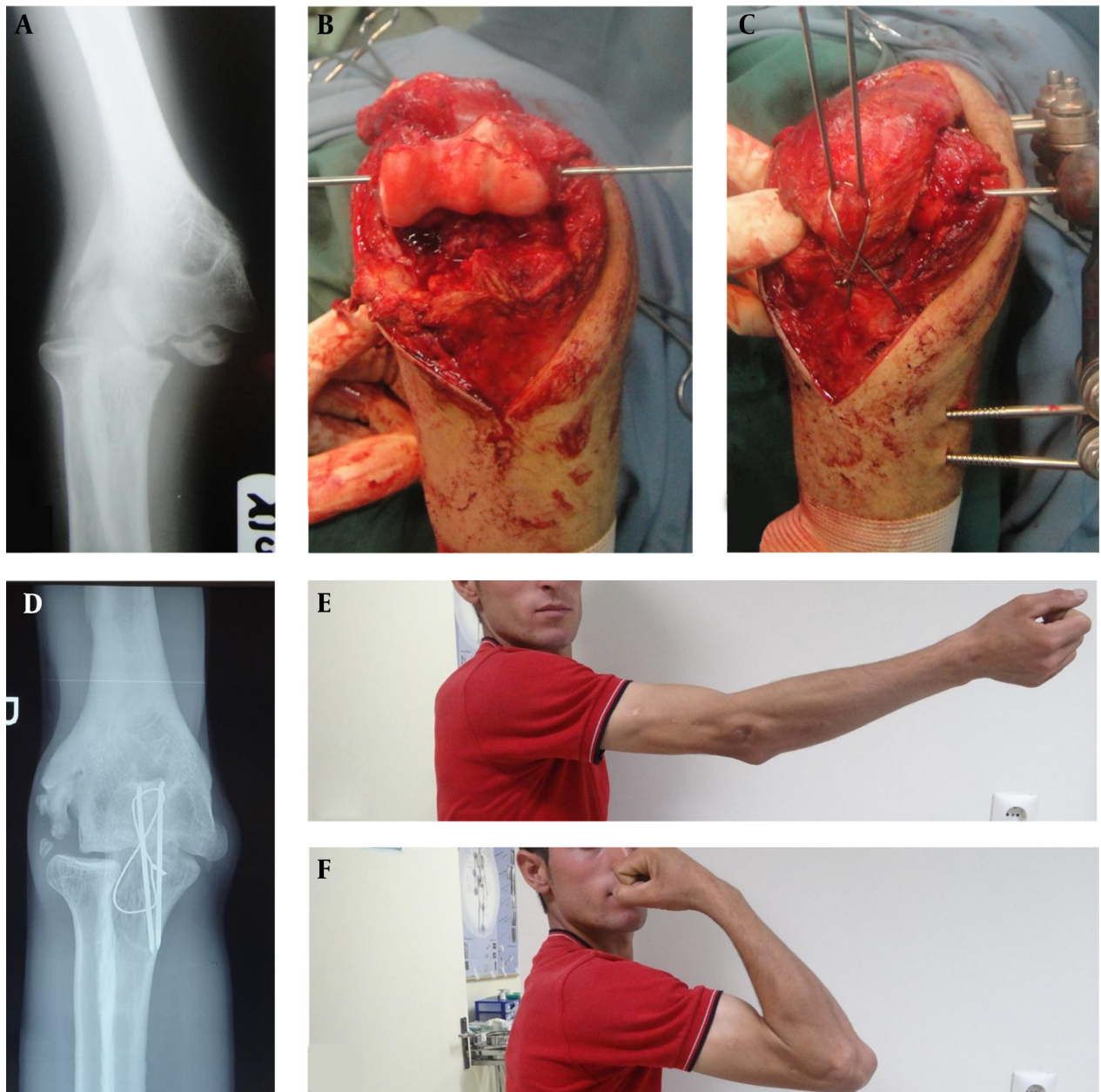
Figure 1. A, Preoperative X-Ray; B, Articular Surface Exposure with Olecranon Osteotomy; C, Tension Band Fixation and Hinge External Fixator Application; D, Final X-Ray after External Fixator Removal; E, F, Postoperative Range of Motion

collateral ligaments. All fibrous tissue was removed from the joint space. If there was any displaced fracture interfering with stability, it was reduced or reconstructed and fixed; otherwise, it was removed. Thereafter, the ulnohumeral joint was reduced and ROM was evaluated. In the olecranon osteotomy technique, the olecranon was first fixed temporarily with a towel clip and then ROM was evaluated. In the long standing cases, usually there was a limitation of flexion. In these cases, with a fractional lengthening through the musculotendinous junction of the distal triceps (Figure 2) and manipulation, the desired