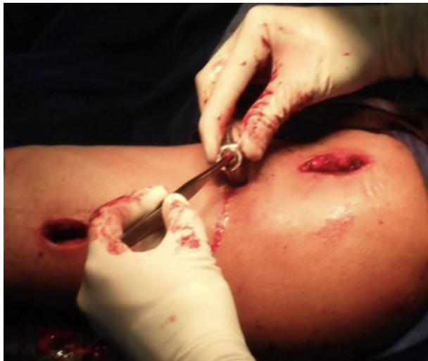
Figure 4. The Bone Graft is Inserted into the Atrophic Nonunion Site Through the Canula.