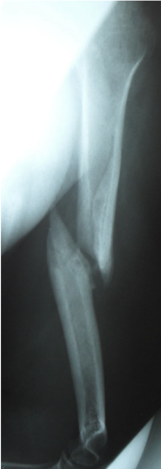
Figure 1. Humerus in Lateral View