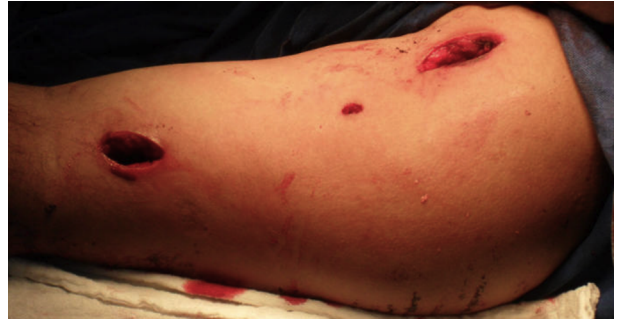
Figure 2. Left Arm

Proximal and distal incisions for plate introduction and screw fixation; an auxiliary incision on the anterior surface of the humerus for the canula introduction.