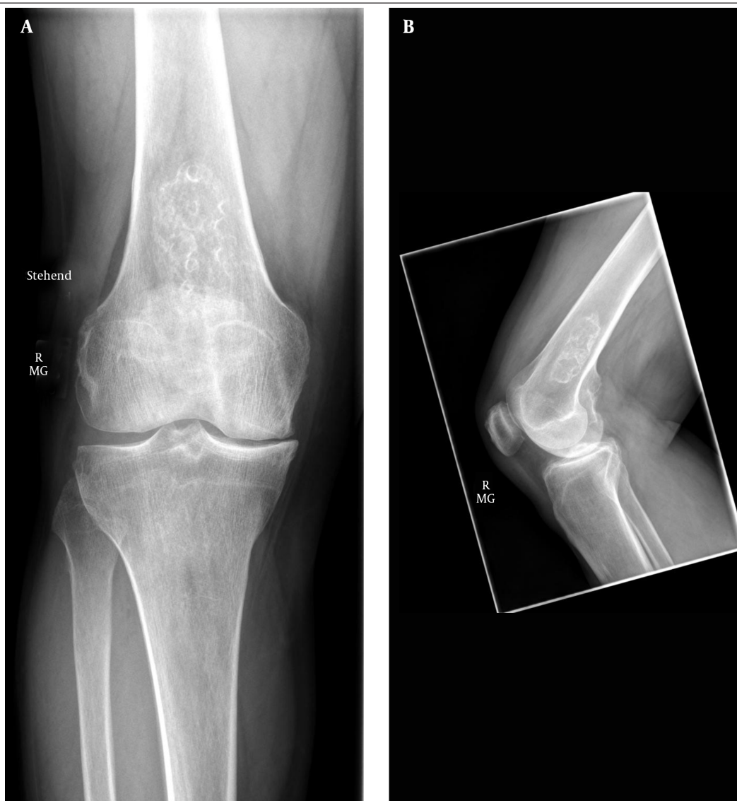
Figure 1. Preoperative ape and lateral Radiographs of the Right Knee Showing a Severe Osteoarthritis Mainly on the Medial Side

examination. We performed a cemented TKR using the Journey II CR system (Smith and Nephew, Memphis, USA) (Figure 2). The Journey II CR is a new prosthesis using the OXINIUM technology (12) to be used in high demanding active patients aiming to preserve the anatomical 3 degrees medial inclination “varus” of the joint line (Figure 3). The patient underwent the scheduled early in-hospital mobilization on two crutches on the first postoperative day. He was discharged after ten days to start a special rehabilitation program for four weeks. The pathological consultation of the tissue specimens revealed an ochronotic Alkaptonuria. A later performed urine test confirmed the diagnosis (Figure 4). Scheduled clinical and radiological assessments after 6 and 12 weeks revealed a satisfied patient with a good knee function with a maximal flexion of 120 degrees without any extension deficiency. The patient was advised to undergo further physiotherapy to optimize the range of movement and strengthen the thigh muscles.