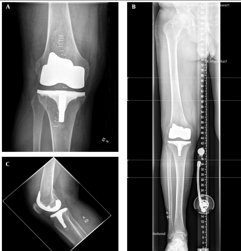
The 3 degrees of medial inclination of the joint line (varus) is achieved through the PE-insert and to be seen in the ape-radiograph.