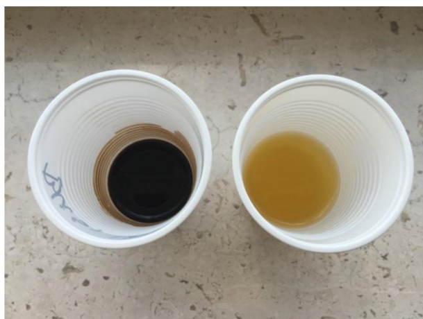
Figure 4. Positive Urine Test