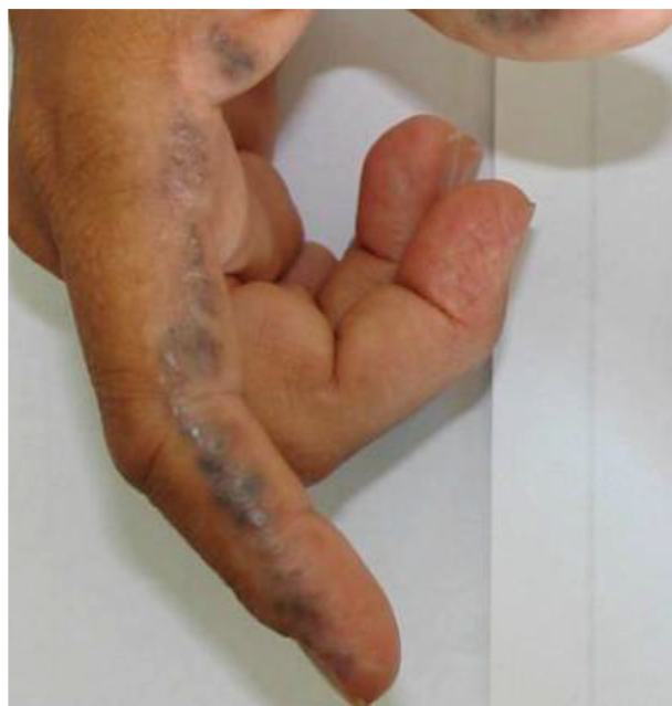
Figure 1. Pigmentation of the First and Second Fingers in Hands

sleep supine. No symptoms of infectious diseases, respiratory and cardiac problems were observed following the surgery. Medications included analgesics needed for back pain. Physical examination demonstrated a significant reduction in the spinal column mobility, loss of range of motion in both knees and hips, and pigmentation of first and second fingers in both hands (Figure 1). Flexion contracture in both knees, decreased degree of lordosis and lumbar scoliosis were also detected.