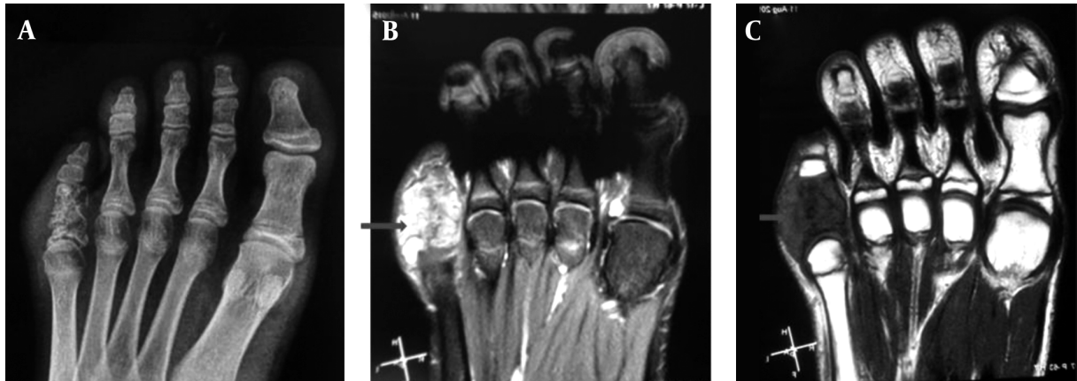
Figure 1. A, Plain radiography of the left foot showing a radio-opaque lesion with destroyed cortices of the proximal phalanx of the fifth toe; B, and C, magnetic resonance imaging of the left foot demonstrating a lesion with high signal intensity on T2 and low signal on T1. On both views, soft tissue component of the tumor is visible (arrows).