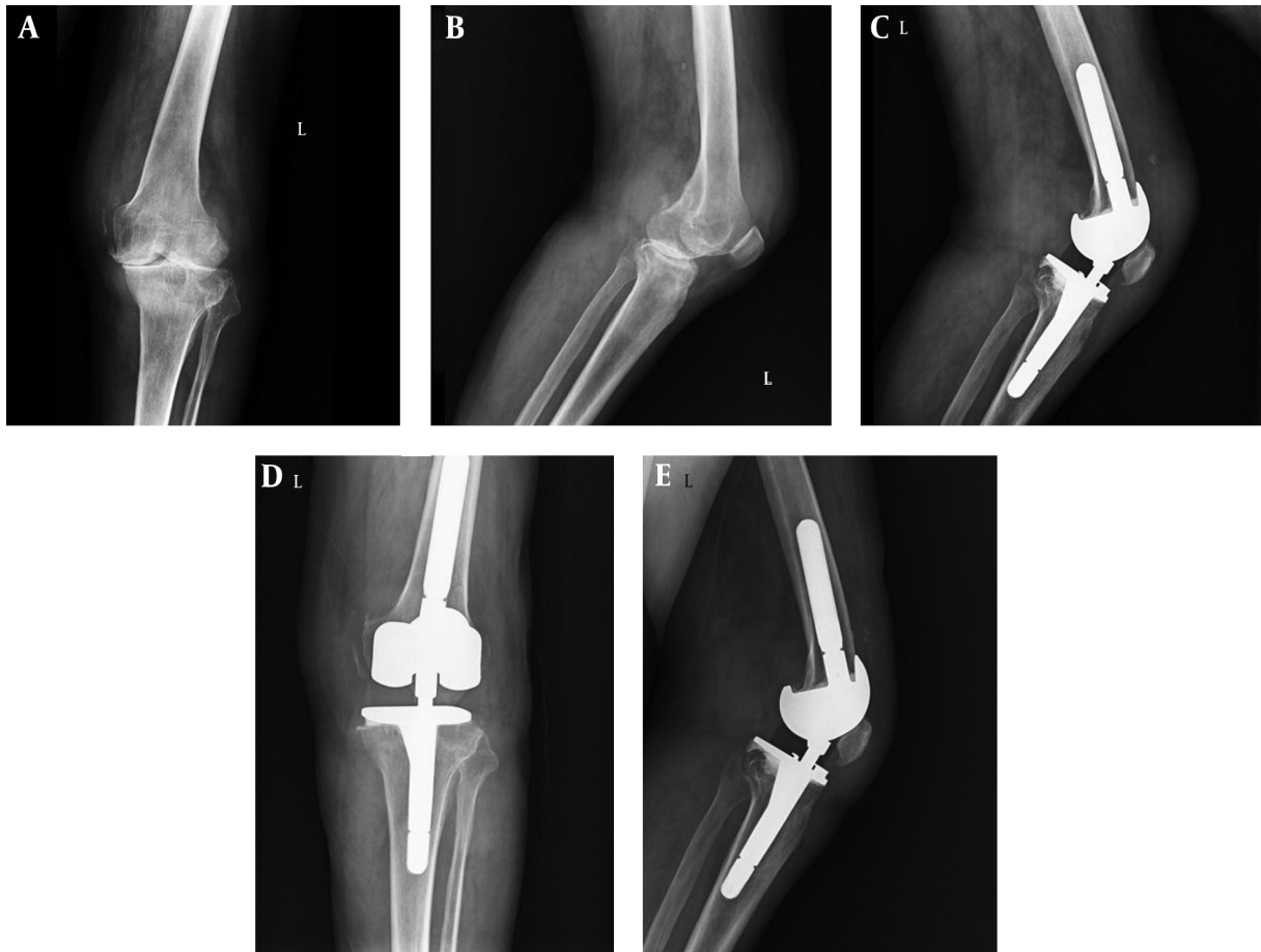
Figure 3. A and B, radiographs show grade 3 osteoarthritis; C, 10 weeks postoperative radiograph after quadriceps tendon rupture; D and E, 9 months after total knee arthroplasty