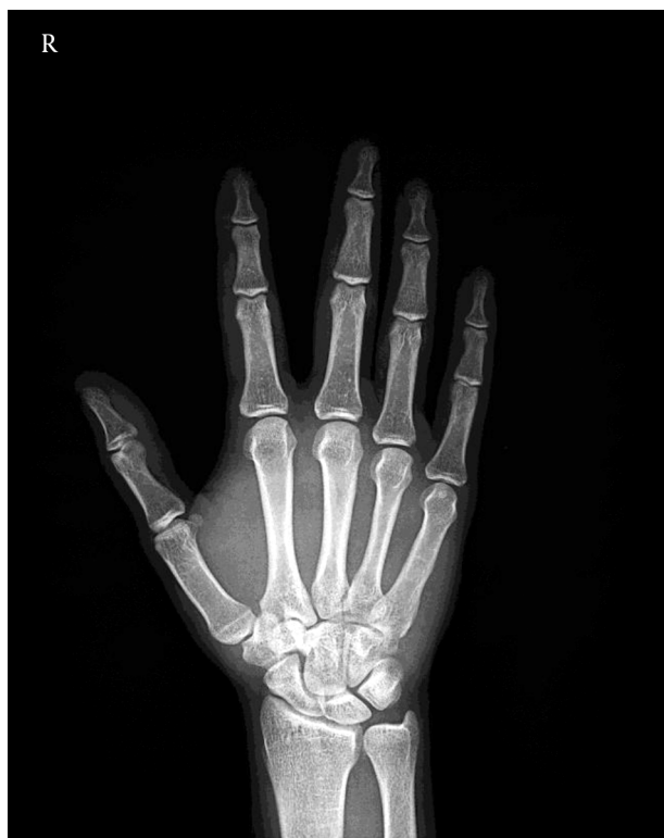
Figure 1. Anterior-Posterior Radiograph of Wrist