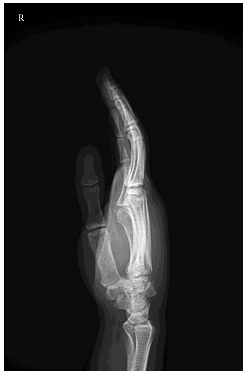
Figure 2. Lateral Radiograph of the Wrist Shows the Avulsion

third one with a mechanism of flexion moment of wrist with contraction of ECRB for avulsion (1,3). Diagnosis of an isolated ECRB rupture is difficult (2,3). The base of the third metacarpal is surrounded by neighboring joints and very strong transverse interosseous and capsular ligaments (3-7), and also concave joint dorsally and ECRB attaching next to a short styloid (5); therefore, avulsion is more prevalent than dislocation. Also, ECRB is more effective for wrist extension than ECRL because of moment arm and not being affected by elbow position (4). Besides abrupt acceleration and deceleration of the tendons for rupture, fluoroquinolone antibiotics are also a cause of tendon rupture especially in Achilles tendon (8); the tendinitis and use of steroids and creatine are also considered (8). Although congruity of the joint is not very important, since there is little movement in the joint (2), open reduction of the fragment is recommended due to the intra articular nature of the fragment (2). Reattaching the fragment may also prevent extensor tendon abrasion and bossing (3). Many types of reattaching the tendon and the fragment are described; cerclage wiring and K-wires (4), anchor sutures and screw (3), tension band wiring (7), anchor suture (1), and tension band (9). ECRB can also be detached from the fragment and