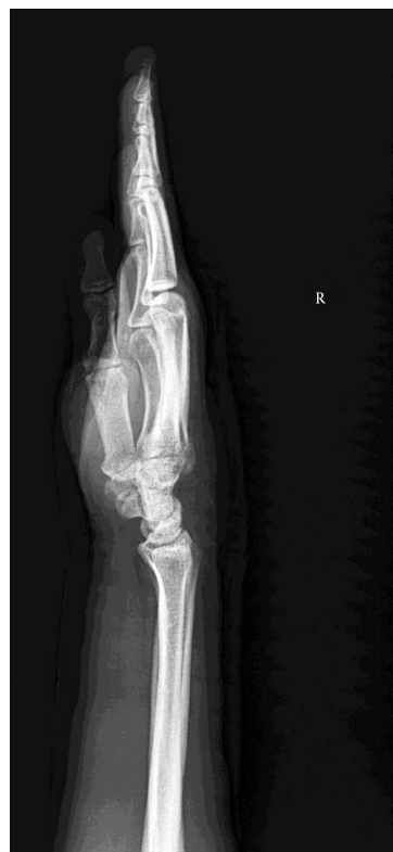
Figure 6. After Pin Removal, the Avulsion Healed

tion site after 12 days and attaching it side to side to ECRL led to loss of grip strength and active motion (3). Even con-