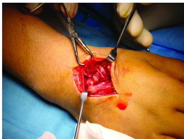
Figure 4. Intraoperative Finding Shows Avulsion of the Base of 3rd Metacarpal Bone