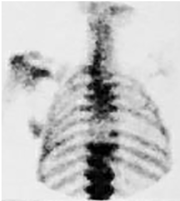
Journal of Research in Orthopedic Science

Figure 3. Bone scan of the spine showing an increased uptake in the lower cervical vertebrae and the upper thoracic vertebrae