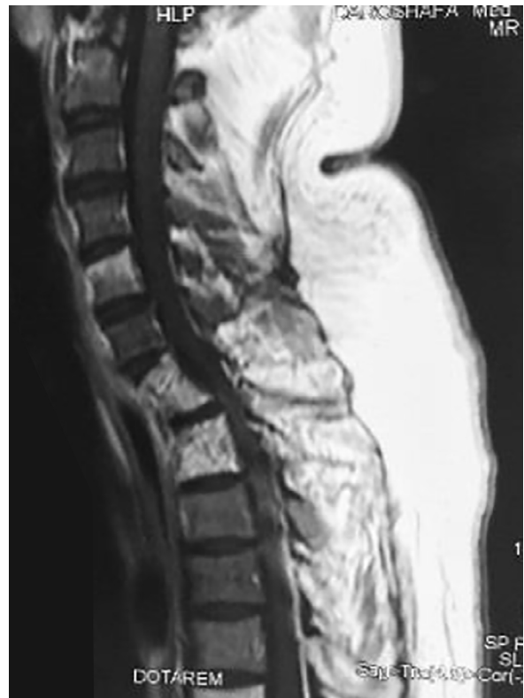
Figure 2. T2-weighted MRI showing a mixed pattern of hyper- and hypo-intense signal identified at C7-T1 region and minimal