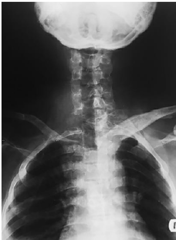
Figure 1. Anteroposterior radiograph of the spine showing the bone destruction in the C7-T1 region

At the radiographic evaluation of the spine, bone destruction was detected in the C7-T1 region (Figure 1). A mixed signal pattern consisting of hyper and hypo-intense areas was also identified in the T2-weighted MRI of the same region along with minimal pressure on the cord (Figure 2). Whole body scintigraphy revealed an increased uptake in the lower cervical vertebrae and the upper thoracic vertebrae (Figure 3). Based