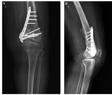
Figure 2. A, Anteroposterior; B, Lateral Radiographs of Left Knee Showing Solid Union of Unicondylar Osteoarticular Allograft.