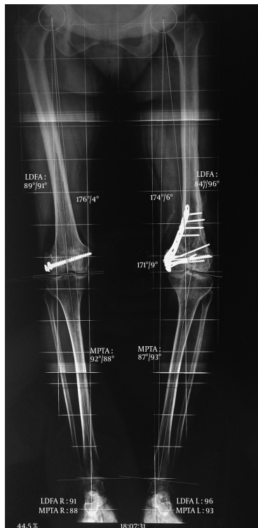
Knee osteoarthritis with varus deformity is evident.

tis outcome score (KOOS) (7), the functional result was excellent. This study was approved by the Ethics Committee of our center and our patient gave her written consent to publish the report.