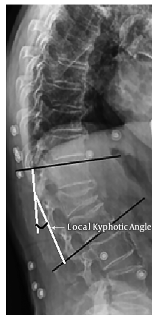
Figure 1. Measurement of local kyphosis, using the Cobb method between superior and inferior vertebrae of the affected vertebra

radiograph, bone mineral density (BMD), magnetic resonance imaging (MRI), computed tomography (CT) scanning, and test of blood 25 (OH) vitamin D level were performed on all patients in the beginning of the study as well. Baseline local kyphosis angle (LKA) was measured using the Cobb method between superior and inferior vertebra of affected level on standing lateral radiograph of affected vertebra (Figure 1). OVCF was classified as: superior endplate, inferior endplate, and anterior cortical wall fracture (Figure 2).