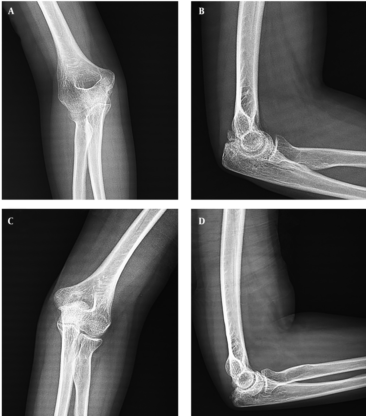
Figure 2. A, anteroposterior and B, lateral pre-operative radiographs of a patient with atraumatic elbow stiffness; C, anteroposterior and D, lateral post-operative radiographs of the same patient

six patients, and burns in one patient. The mean time period from the diagnosis to the surgery was 14 \pm 6.4 months, ranging from 5 to 24 months. The mean follow-up period