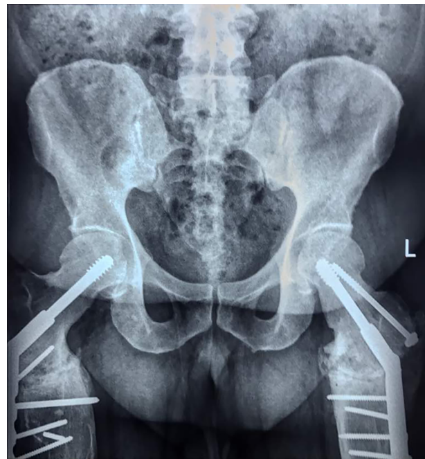
Figure 5. The pelvic radiography six months after surgical treatment showed suitable union with correction of neck-shaft angle.

fluoride treatment, and pelvic irradiation (4-6). In contrary to insufficiency fractures, fatigue fractures occur in the normal bone of healthy individuals as a result of excessive and repetitive loads. It usually happens in athletes, dancers, and military personnel. It can also occur due to normal forces applied to abnormal anatomy (3, 4). In in-