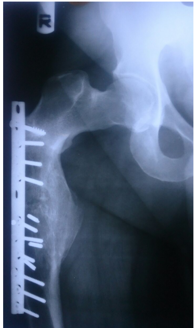
Figure 2. Specific AP view of the right hip. A fracture line is demonstrated in the superior border of the right femoral neck.

and anti-rotational partial thread cancellous screw. We estimated the degree of correction in AP and lateral view by guide pin under fluoroscopy.