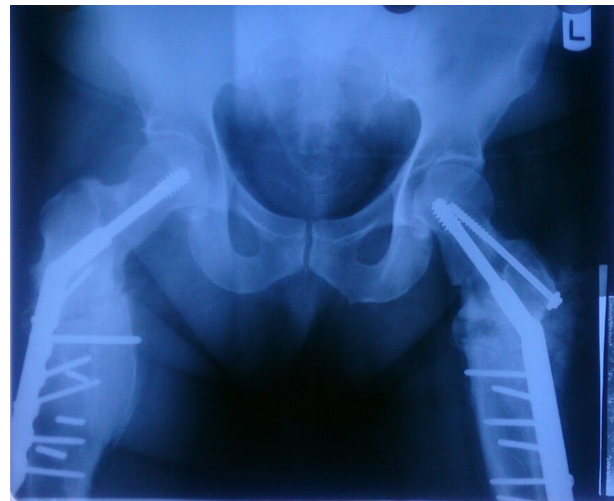
Figure 4. Post-operative AP view of both right and left sub-trochanteric valgus osteotomy and fixation with DHS 135.

Insufficiency fractures occur in weak and defected bones under normal daily forces. Different risk factors have been proposed for these fractures, including osteomalacia, osteoporosis, long-term corticosteroid and anti-convulsant treatment, renal osteodystrophy, amenorrhea,