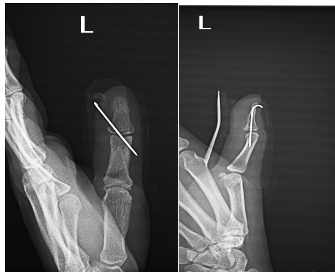
Figure 2. Post-operative x-ray

Journal of Research in Orthopedic Science